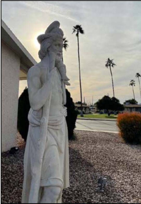
Statue of St. Christopher in the Front Yard