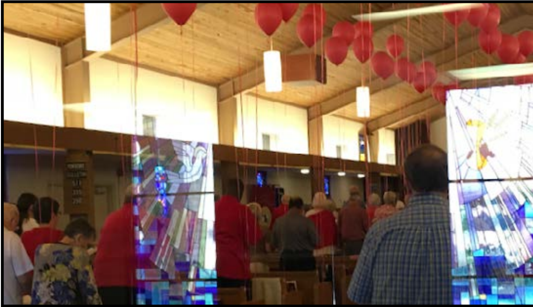
Stained Glass Reflected into the Nave on Pentecost

In this ever-changing world, God calls each of us to work and to love in Christ's name. At St. Christopher's, we offer many opportunities for parishioners, friends, and neighbors to answer God's call in meaningful ways.