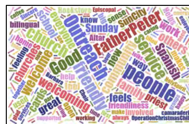
Word Cloud from Discernment Notes

The three phases are to discern, study, and ask.