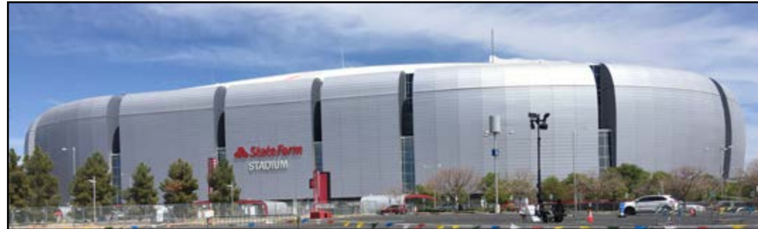
State Farm Stadium

Maricopa County - maricopa.gov - Sun City is an unincorporated community in Maricopa Co