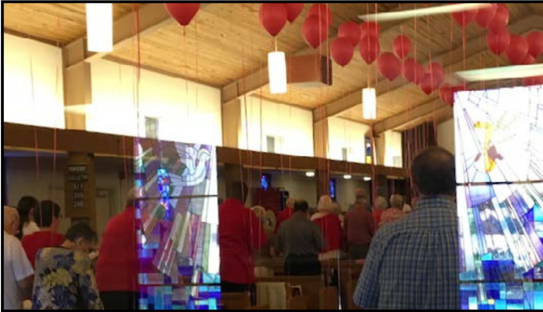
Stained Glass Reflected into the Nave on Pentecost

In this ever-changing world, God calls each of us to work and to love in Christ's name. At St. Christopher's, we offer many opportunities for parishioners, friends, and neighbors to answer God's call in meaningful ways.