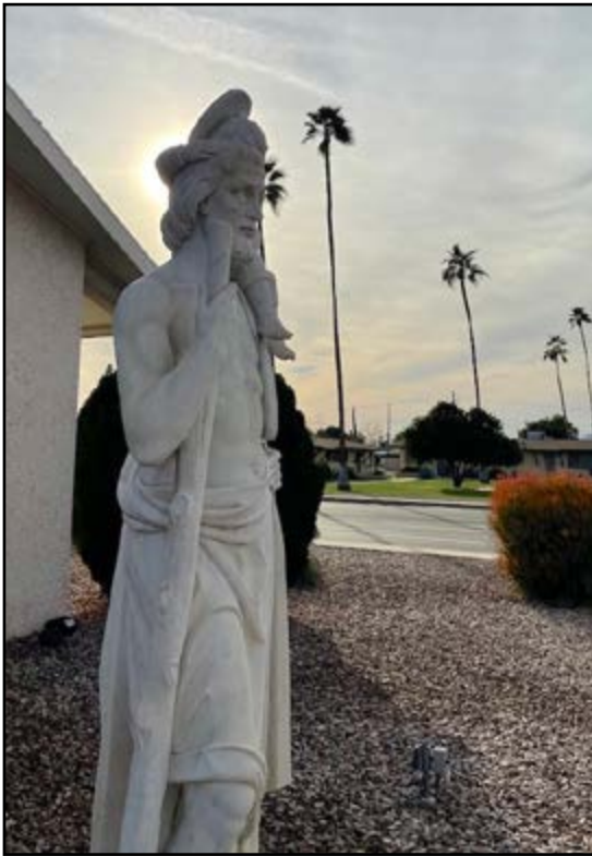
Statue of St. Christopher in the Front Yard