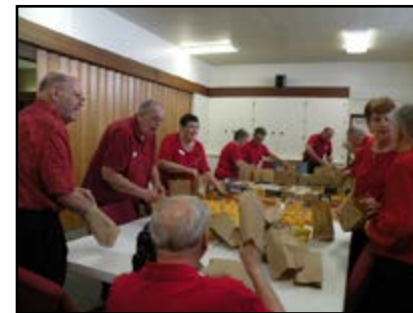
Lunches for Homeless (With Salvation Army)

variety of life-changing outreach ministries. A few examples of our work are the Valley View Food Bank, lunches for the homeless at the Salvation Army and our Summer Water Drive for the Phoenix Rescue Mission.