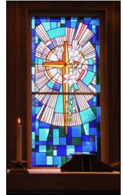
Chapel Stained Glass behind Altar